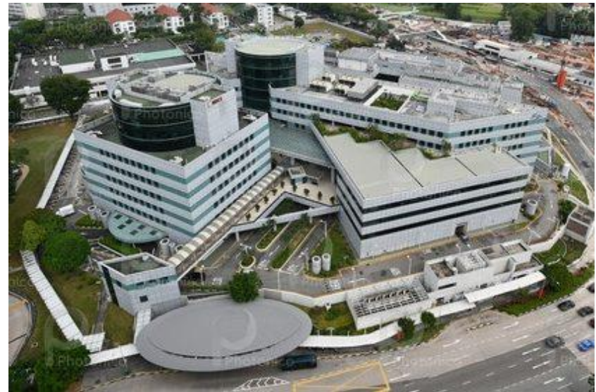
Singapore General Hospital in 2020