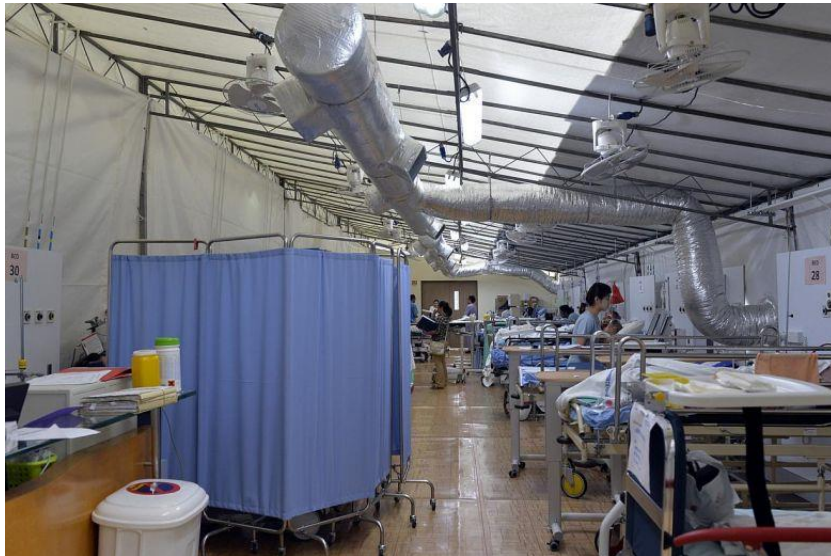
Air-conditioned tents in Changi General Hospital, Singapore