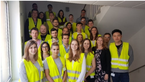
Henkel, Summer Semester 2018